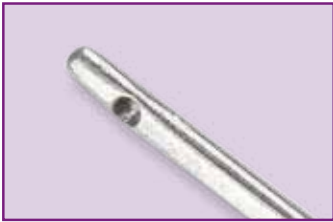
Tapered Tip, Port on Underside