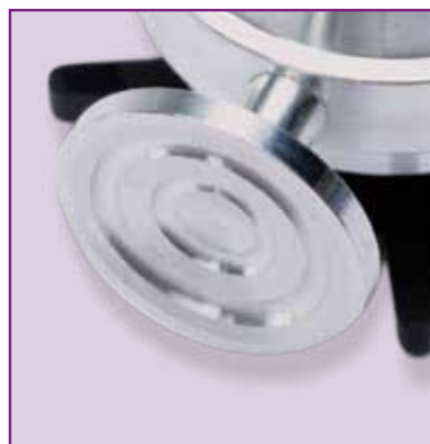
Non-Slip Grooved Finger Grips